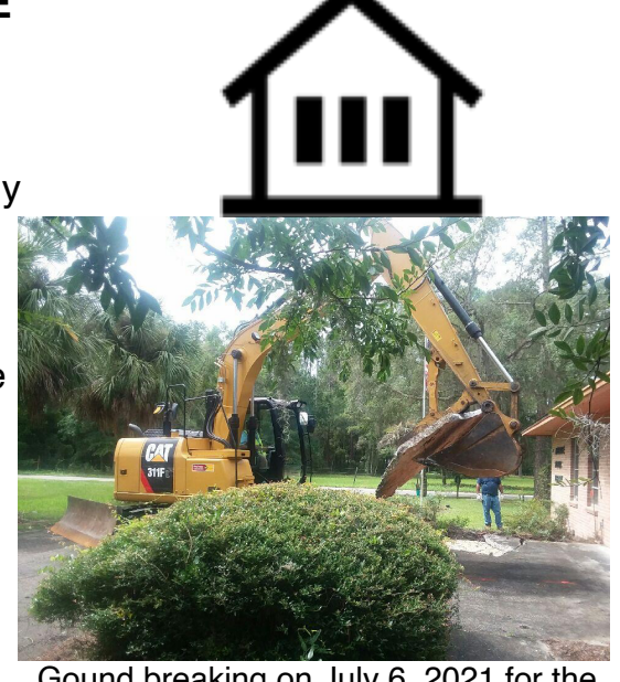
Gound breaking on July 6, 2021 for the new library expansion.

The library expansion and renovation project is underway! We received our permit from the County on June 28th and Blackwater Construction Services started demolition on July 6th. The east side of the library between our building and the Post Office will be closed to vehicular and pedestrian traffic for approximately three months as the project progresses. In the next few months, you can expect to see footers poured, block and brick laid and a new roof for the entire library installed. The MLA deeply appreciates the support of Putnam County and our community and are pleased to welcome Blackwater Construction Services to Melrose!